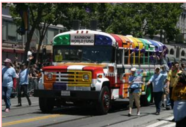
The Rainbow Bus was featured in this year's Parade.

San Francisco queer humanitarian aid agency Rainbow World Fund is hitting the road in October with the "Bus of Hope," and it is looking for volunteers and donors right now. The eight-year-old LGBT-and-friends aid organization is currently packing its school bus - a rainbow-colored fixture seen at recent Pride events and in the Castro - with 5,000 pounds of medical supplies, medicines, and school supplies to aid community groups in Tijuana, Mexico. The week-long trip, which starts Oct. 5 in San Francisco, includes stops in Sacramento, San Jose, Los Angeles, Long Beach, and San Diego to pick up donations from churches, colleges, community groups, and individuals.