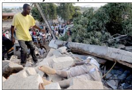
TRYING TO HELP | A man approaches a body lying in the rubble along Delmas road the day after an earthquake struck Port-au-Prince, Haiti.

Tuesday's 7.0 earthquake near Haiti's capital devastated the already impoverished country. News and information from Haiti has been difficult to obtain because their previously fragile infrastructure was not designed to handle a disaster of this magnitude.